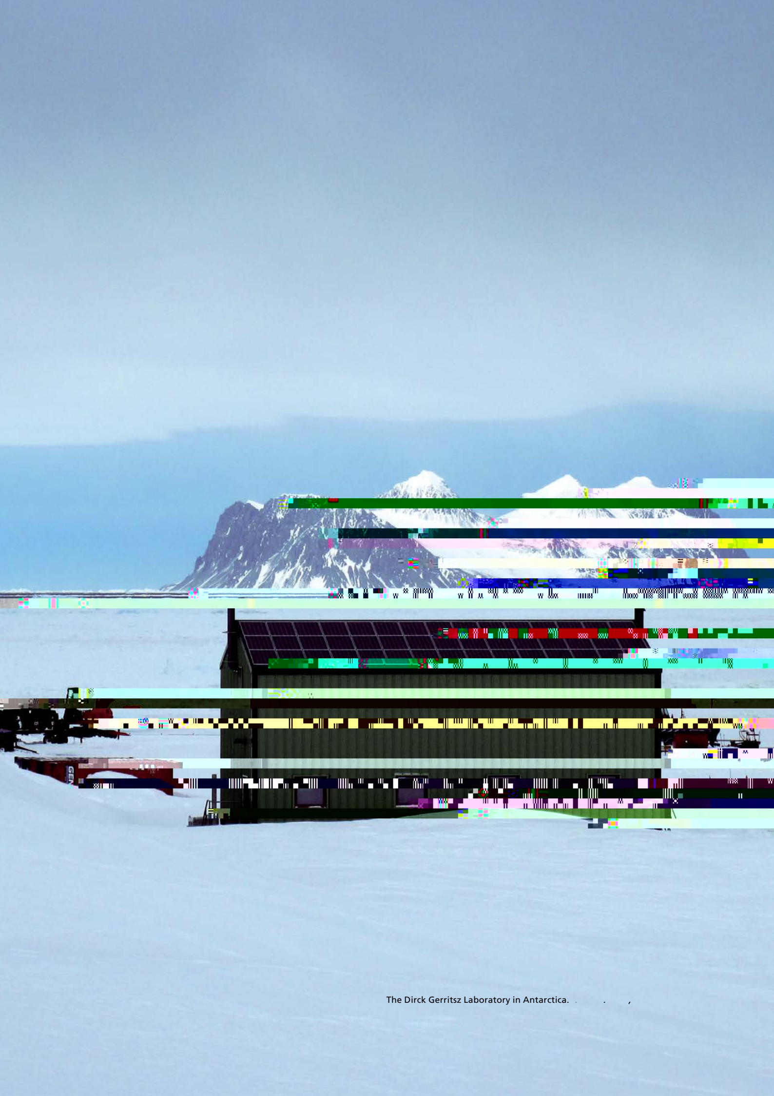
The Dirck Gerritsz Laboratory in Antarctica. . . . .