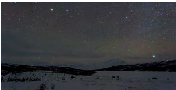
Night sky at Denali National Park.

Astronomy traditions vary across cultures, communities, and individuals. The information collected here is a small sample of how some cultures view the night sky.