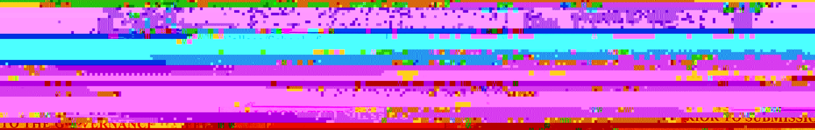
Figure 2: Faculty Department, U.C.